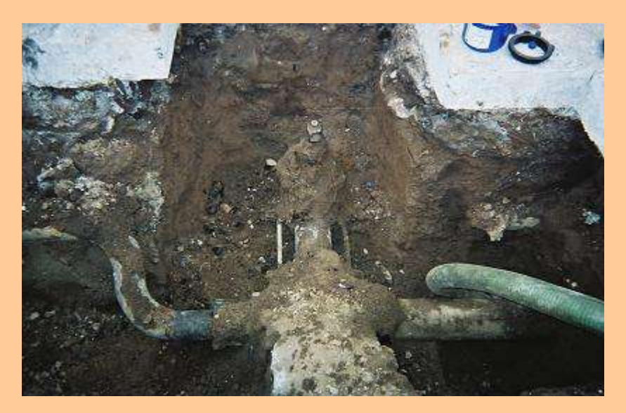
phelan5-001.jpgp5a61n.jpg, image/jpeg, 414x265

A specifc public works project became "classified" following 911. This project, which has been on-going throughout the U.S., has lethal capabilities for innocent U.S. citizens.